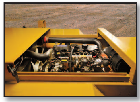
ENGINE: Powerful Perkins 4-Cylinder Tier 3 (Stage IIIA) Turbo Diesel offers minimal fuel consumption with simplicity of maintenance through easy access sliding hood. Optional 6-cylinder Turbo Diesel available.