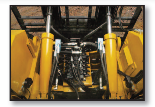
HYDRAULICS: Programmable multi-function electric joystick combines ease of operation with exceptional accuracy. The heavy duty components have been spec'd to meet demanding rough terrain conditions.