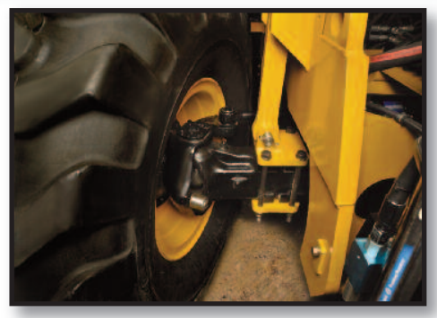
STEERING CONTROL: Fully hydraulic power steering with 3 modes (4-wheel, Crab, 2-wheel) provides versatility in the toughest terrains.