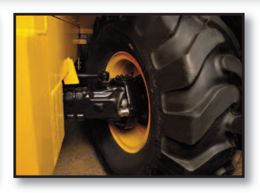
AXLES: Planetary gear reduction at each hub allows efficient power transfer to the ground while 20 degrees of total axle oscillation maintains traction at all times.