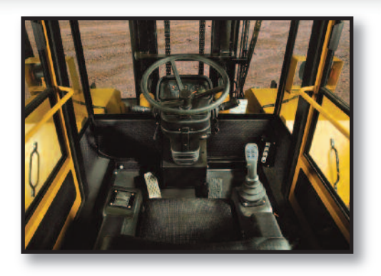
CLOSED CAB: The all-weather closed cab option is equipped with sound insulation, defroster fan, heavy duty heater, ergonomic controls, sliding windows, removable doors, and a 360 degree visibility for safe, efficient operation.